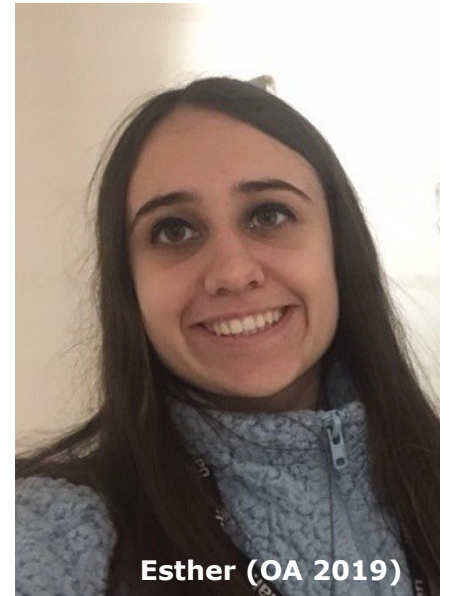
Esther (OA 2019)

Connections continued with a talk for Y12 students: 'Applying to Art College'. Forthcoming sessions with Old Alfredians include advice on careers in TV, Music, and Film Studies.